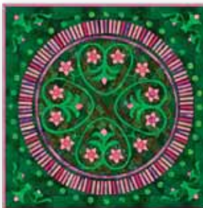
Star Flower Medallion EQ6 Virtual Quilt

Lemon Tang was first a quilt before it was an EQ project. This little wall quilt was my result of a guild challenge - the packet had four fabrics, one of which was lemons, both whole and sliced. I made the quilt using the whole lemons on the fabric for the fish bodies and the slices for their fins. When I decided to add this to my published pattern offerings, I used EQ to create the pattern. By importing a photo of the quilt into EQ I was able to trace it exactly, and got a full-sized appliqué pattern by taping together the 9 sheets that I printed from EQ, and then had it copied and printed by a copy shop for the pattern insert.