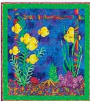
Lemon Tang Finished Quilt