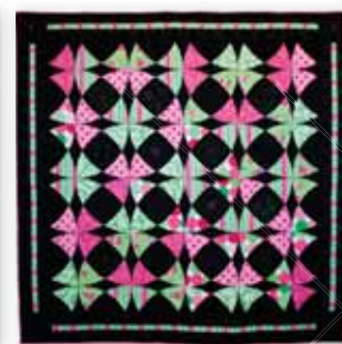
Garden in the Round Finished Quilt