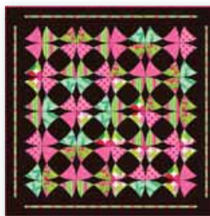
Garden in the Round EQ6 Virtual Quilt

Using Electric Quilt 6 to create this design allowed me to create the look of overlapping circles in the traditional Winding Ways quilt pattern. As the fabrics I had chosen for the quilt were almost all remnant pieces, I didn't have the luxury of cutting a lot of patches and playing on the design wall until I found the look I wanted. By importing images of the fabrics into EQ6, I was able to very quickly 'plug and play' with my fabrics in the design before I cut a single patch. This gave me the freedom to experiment until I was satisfied with the look, then cut out only the exact pieces I needed--with no fabric wasted!