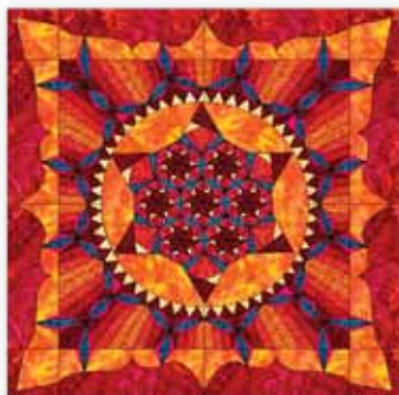
Sizzling Crystals EQ6 Virtual Quilt