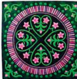
Star Flower Medallion Finished Quilt

With Star Flower Medallion, I drew the diamond-pieced background in EasyDraw by first making a 10 x 10 block grid, turned it 45 degrees, and stretched it into diamonds. With the Arc tool I drew a circle over it then deleted all the grid lines outside the circle. Two more circles outside that and I had the flange and piping details. The Wreath Maker came in handy to make the piano keys border and also to place all the dots evenly around the keys. I was able to print the motifs directly onto freezer paper for my favorite method of turned-edge appliqué.