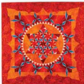
Sizzling Crystals Finished Quilt