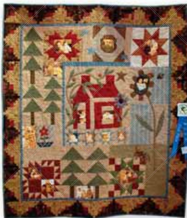
Trimpi Land Finished Quilt

“Being able to watch the short videos on different aspects of the program was invaluable to me.”