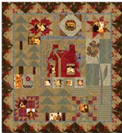
Trimpi Land EQ6 Virtual Quilt

The reason the virtual Trimpi Land looks so much like the actual one is that most of the pictorial blocks were made prior to putting it all together in the final design. I used the actual blocks to learn to draft them in Electric Quilt 6. I colored them with fabrics we had already used. By using the features available in the custom set layout, we were able to see what we still needed to fill in the blanks and to determine a good balance for the project. Being able to watch the short videos on different aspects of the program was invaluable to me. It was watch the video, draft this block, watch a video, draft that block and then learn how to manipulate it all for the final project. Being able to “color” our quilt with fabrics we had already used from the chosen line also let us see where we needed to incorporate a different fabric or color to enhance the quilt. The EQ Simplified book was a wonderful guide but the built-in help features really saved the day for me.