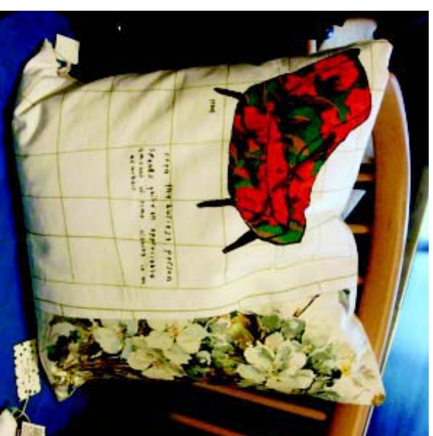
Applique cushion from Liberty, London

New sewing kits -- mostly for children's toys -- are springing up at key stores, while sewing supplies (i.e. pin cushions, sewing boxes) are being redesigned for contemporary appeal. Buttons and sewing machines are surprise top sellers everywhere. 🧵