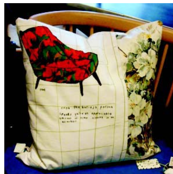
Applique cushion from Liberty, London

Fly The Flag: Flag imagery appeared last spring and continues to explode, for the home. Beginning with the British flag, it is now spreading to flags of other countries along with interpretations of flag graphics and in neutrals as well as traditional red, white and blue. Is this a new patriotism or just a love for the graphic look? Figurative imagery is everywhere -- dogs, cats, squirrels, deer, and birds appear as once again fashionable china ornaments and on tableware, shopping trolleys, decorative cushions, etc. Look, too, for guitars, drums, cars, and bicycles.