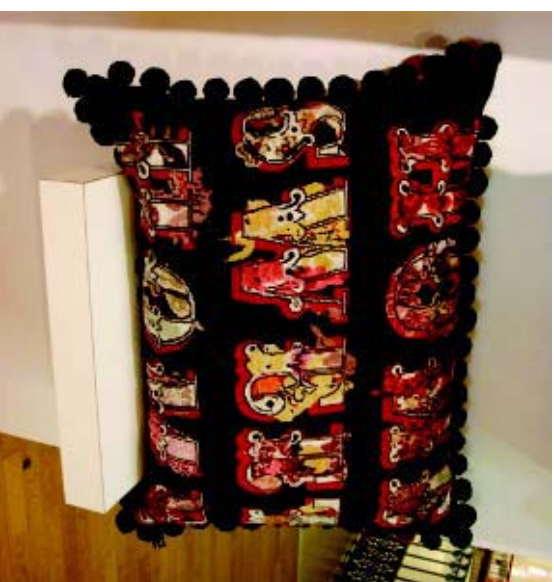
Home Sweet Home Tapestry Cushion from Bon Marche, Paris

At the same time, farm animals and birds such as chickens and ducks are appearing in print and three dimensional form as decorative objects. (Note that keeping live hens and ducks is a fashionable new hobby for those with enough space whose zoning laws allow it.)