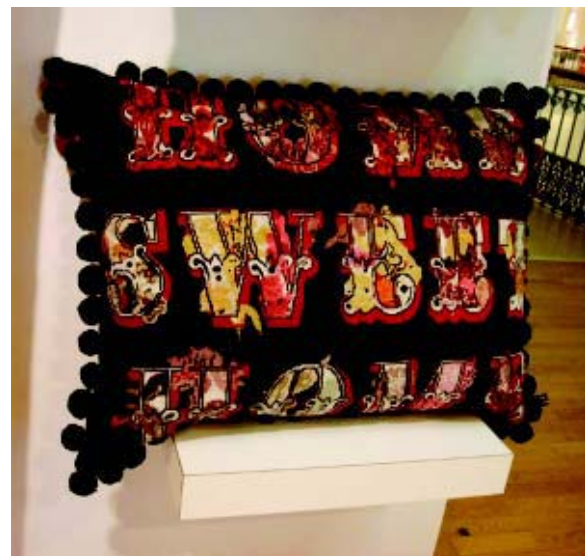
Home Sweet Home Tapestry Cushion from Bon Marche, Paris

Recycle, Remake, Re-use: Recycling is a long running trend, and includes items that have been remade or reused, like secondhand furniture. Vintage mirrors, chairs, sofas, lamps are being transformed with bright, often glossy color (think yellow, orange, red, green) while a mix of bold, unexpected, even a patchwork mix of fabrics make recycled items at once worthy, individual and eye-catchingly distinctive.