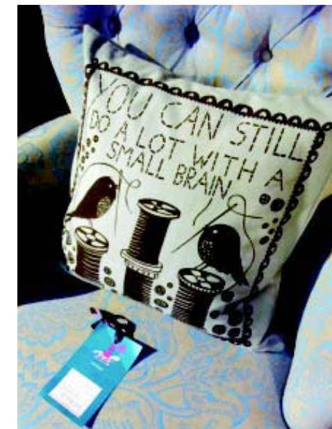
"You can still do a lot with a small brain" cushion from Liberty, London

Nostalgia: With hard times comes nostalgia for the Good Old Days -- primarily the 1950's -- when we think things were better or at least easier. As well as an ongoing interest in 50's design, there's an increasing delight in everyday 50's imagery -- kitchen curtain prints, advertising motifs, kitchenalia, aprons, etc.