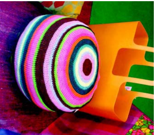
Crochet stool from Conran, London

Jo-an Jenkins is an internationally known analyst, forecaster and speaker, presenting key retail trends from the new, boutique, on-line service for mainstream fashion and home decor at retail, TrendPulse.net. With more than 30 years experience in reporting, clarifying and tracking trends in retail, color, print/pattern, design and lifestyle, Jo-an has launched this new Web based service to fill the need for tightly edited, very focused information in an increasingly complex market.