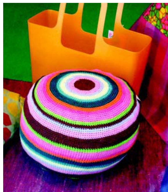
Crochet stool from Conran, London

At the same time, farm animals and birds such as chickens and ducks are appearing in print and three dimensional form as decorative objects. (Note that keeping live hens and ducks is a fashionable new hobby for those with enough space whose zoning laws allow it.)